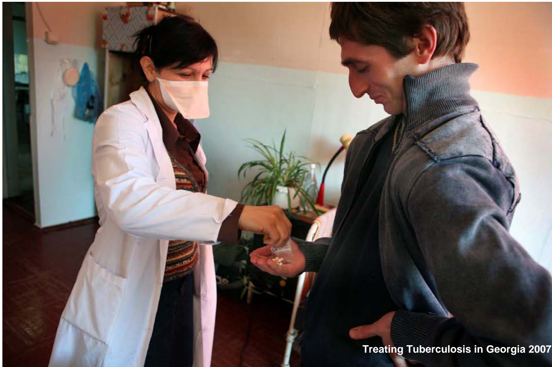
Treating Tuberculosis in Georgia 2007