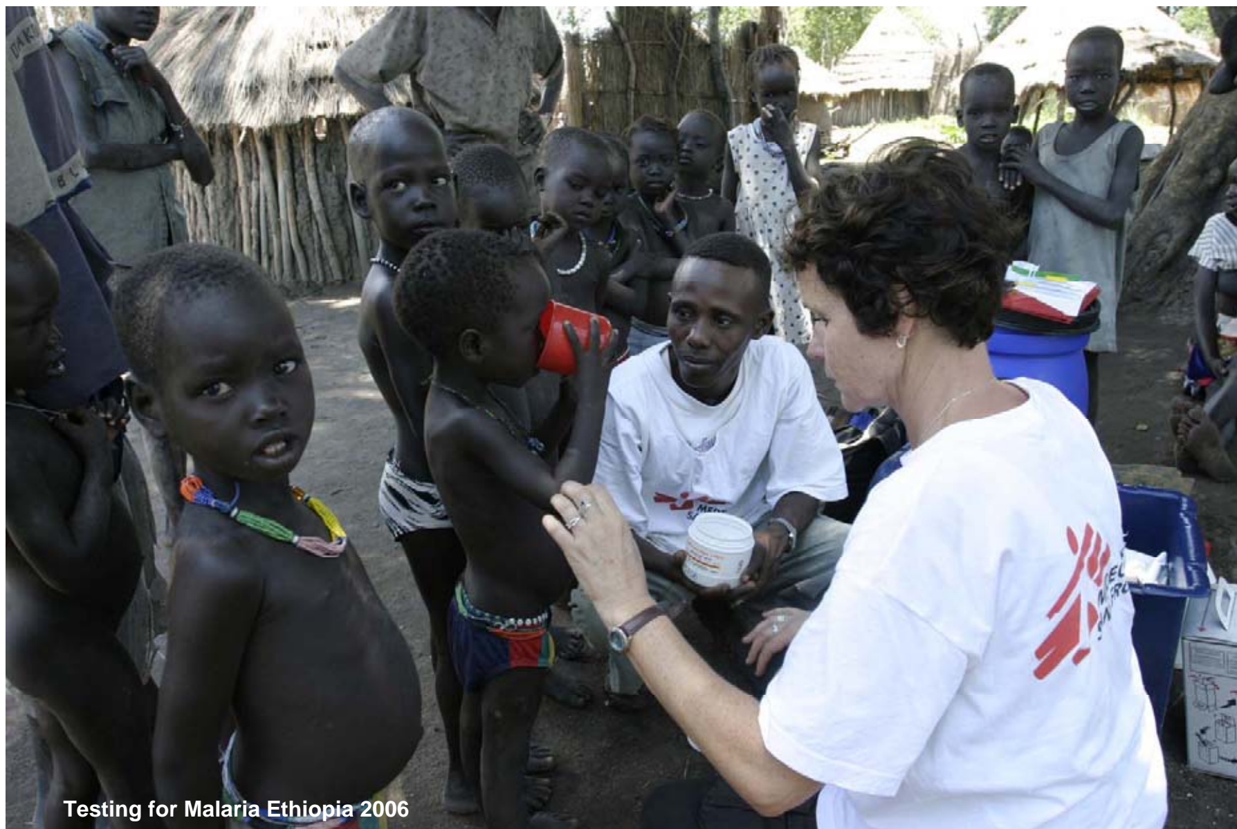
Testing for Malaria Ethiopia 2006