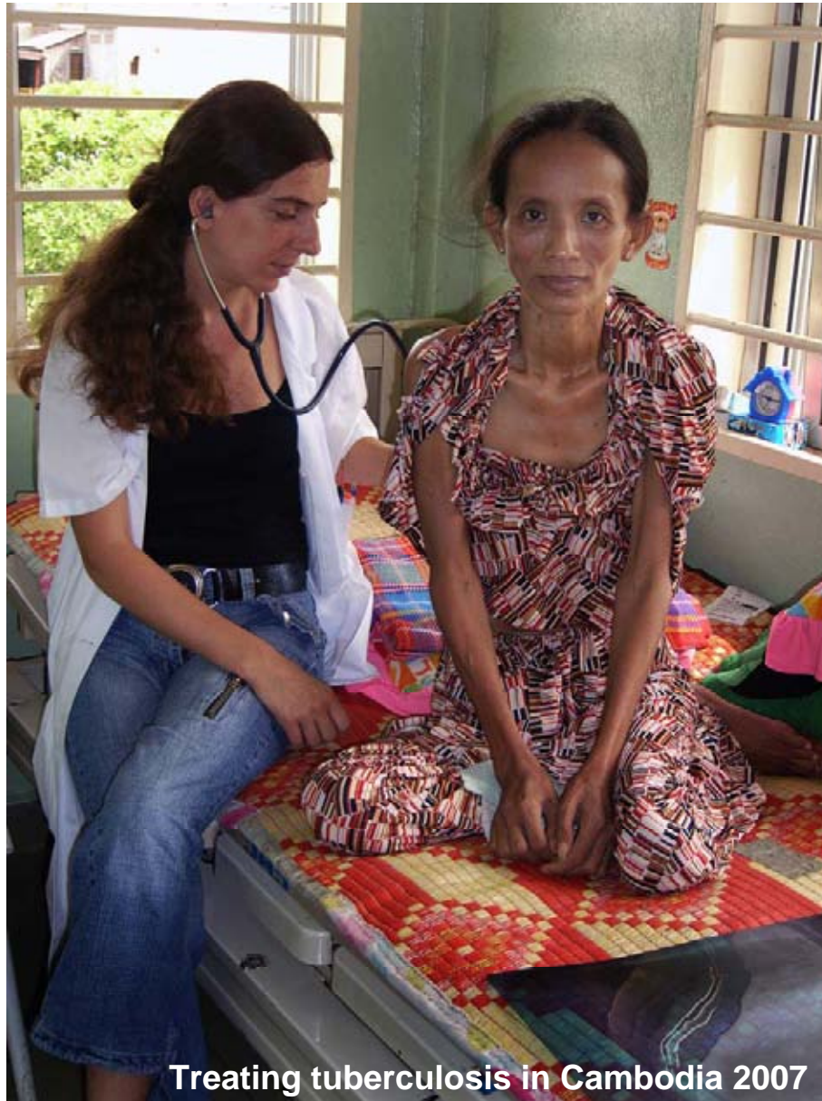
Treating tuberculosis in Cambodia 2007