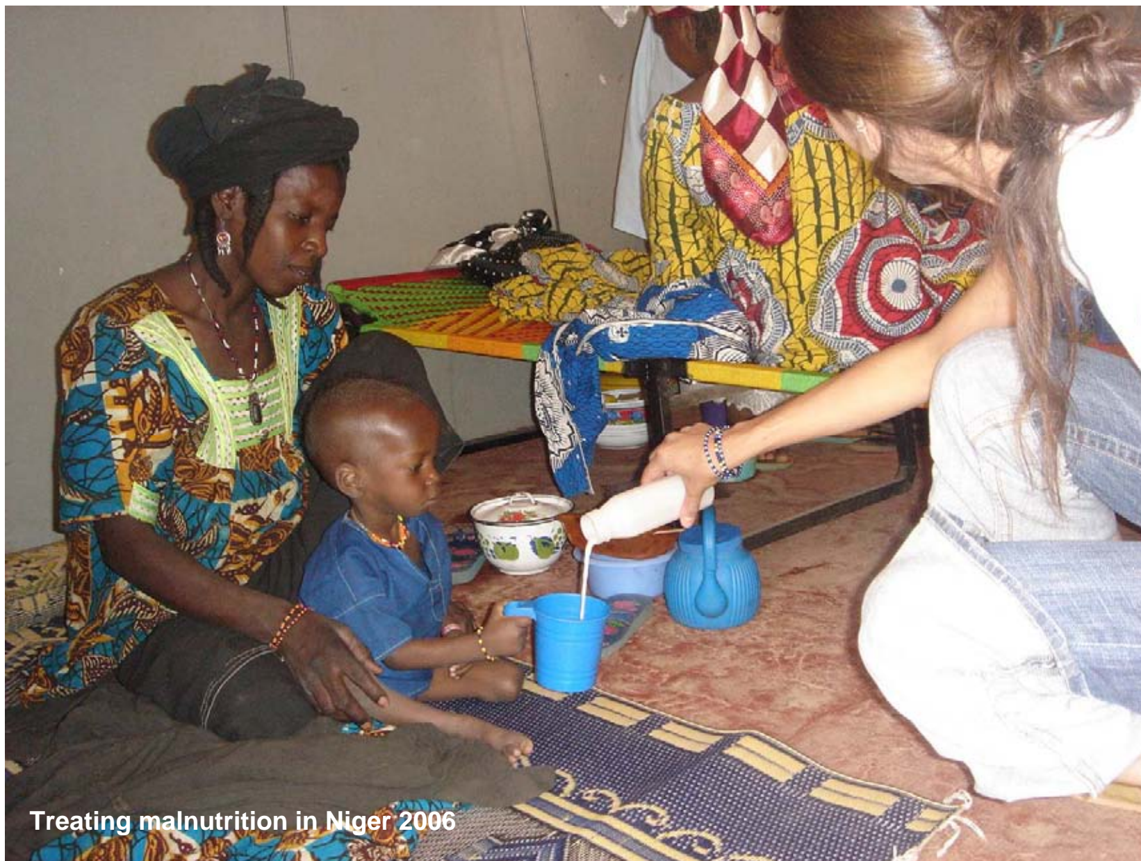
Treating malnutrition in Niger 2006