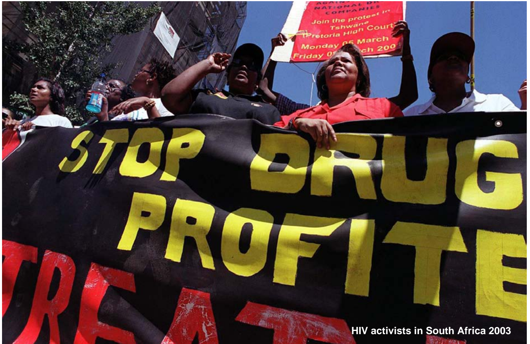
HIV activists in South Africa 2003

MEDECINS SANS FRONTIERES DOCTORS WITHOUT BORDERS