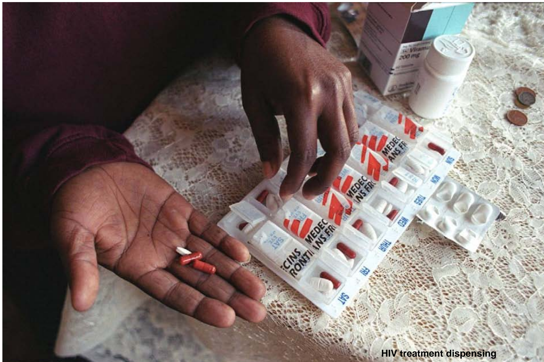
HIV treatment dispensing