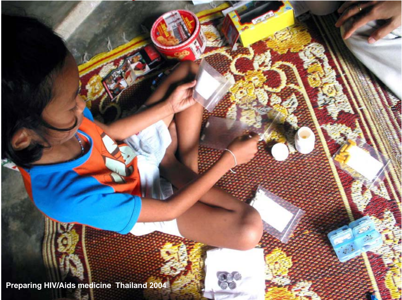
Preparing HIV/Aids medicine Thailand 2004