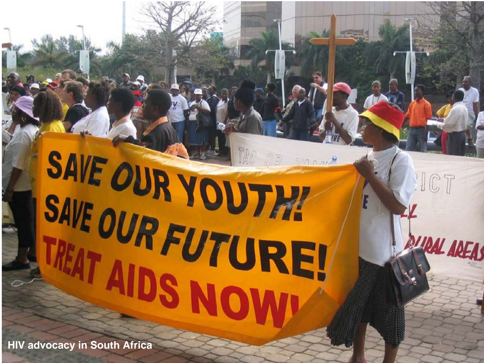
HIV advocacy in South Africa