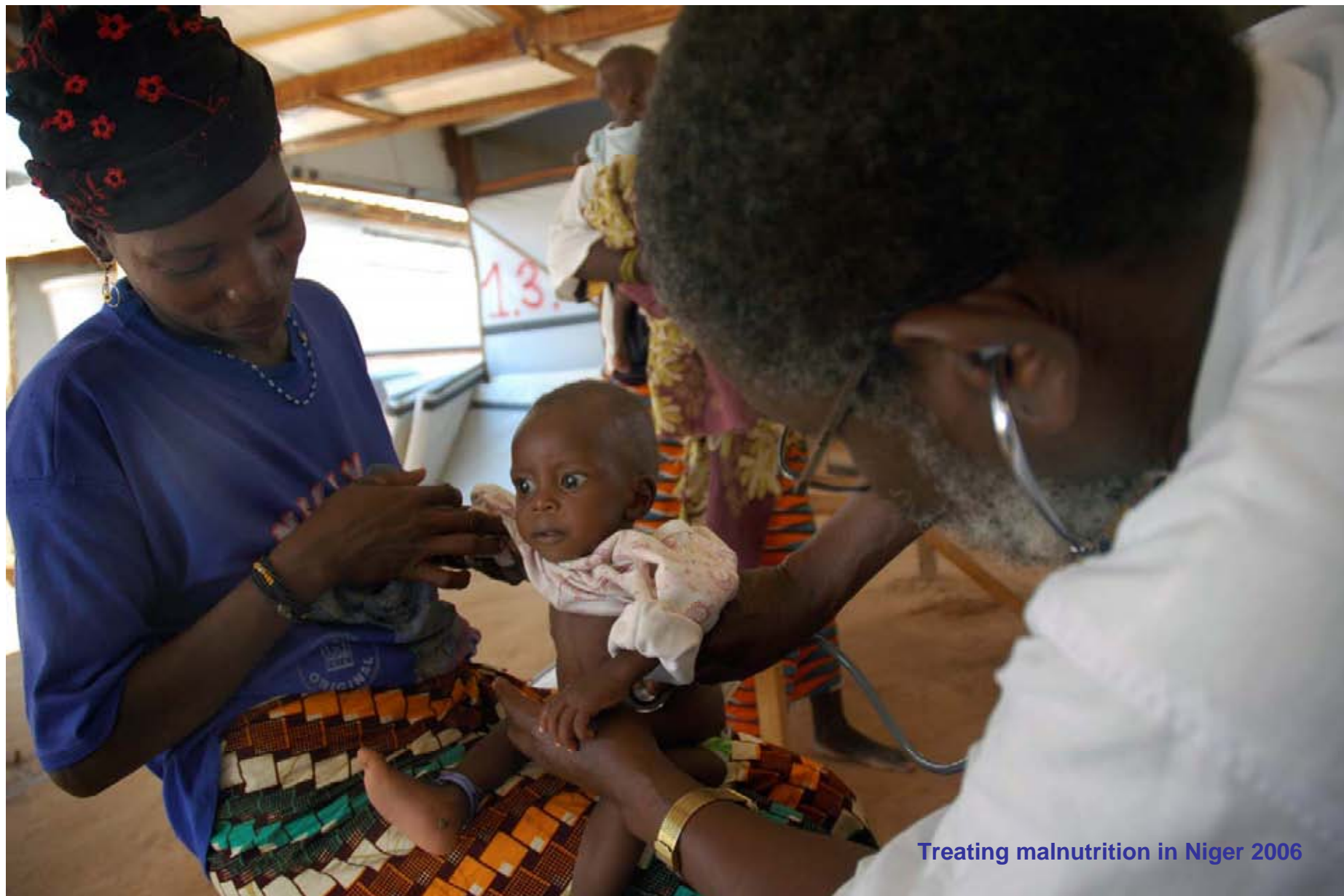
Treating malnutrition in Niger 2006