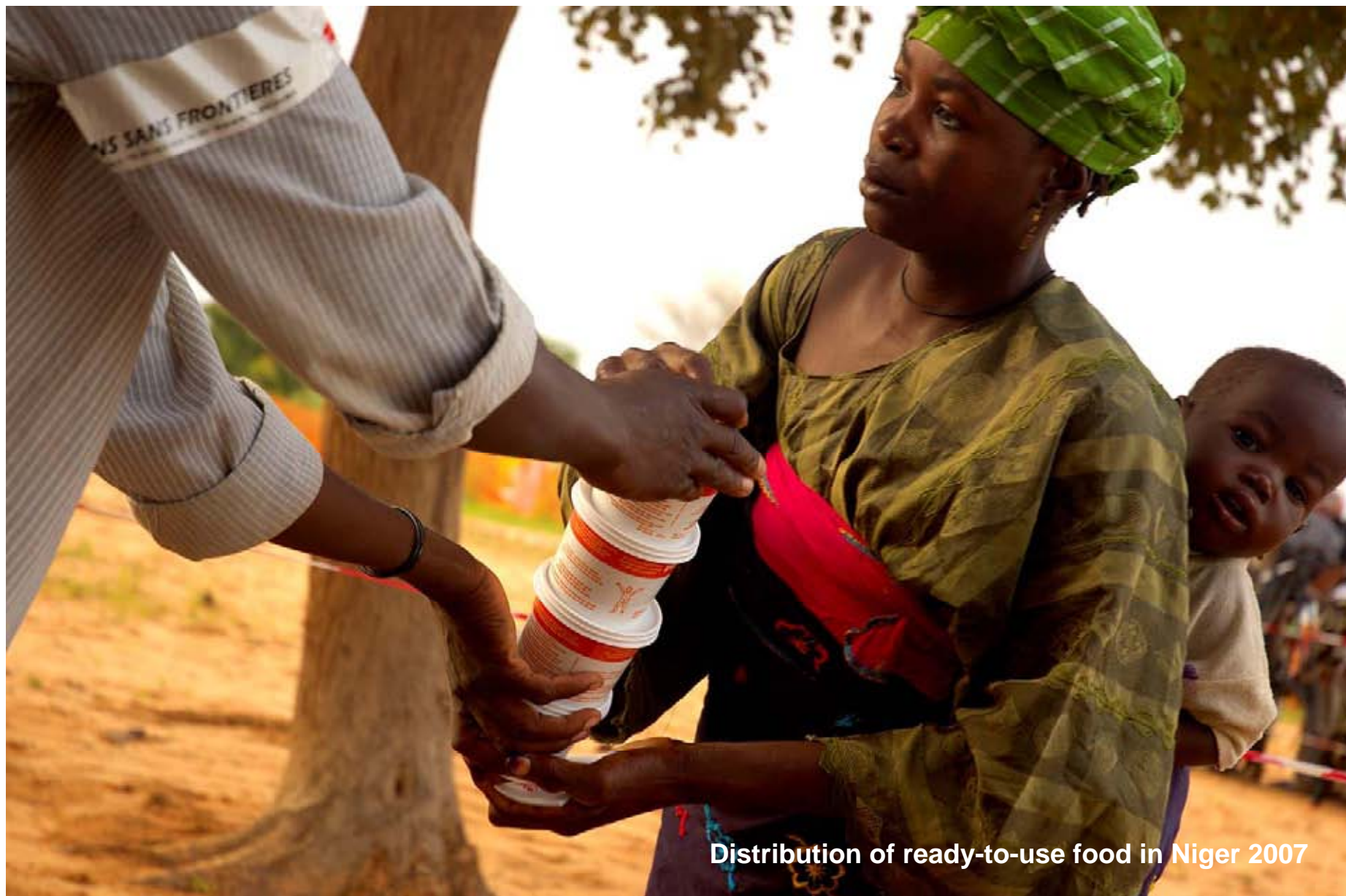
Distribution of ready-to-use food in Niger 2007