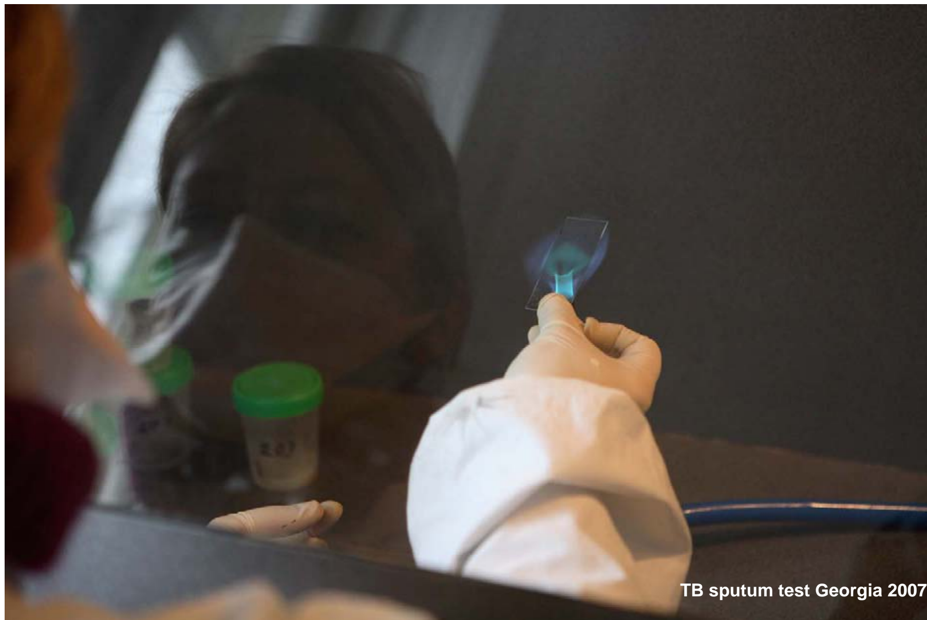
TB sputum test Georgia 2007