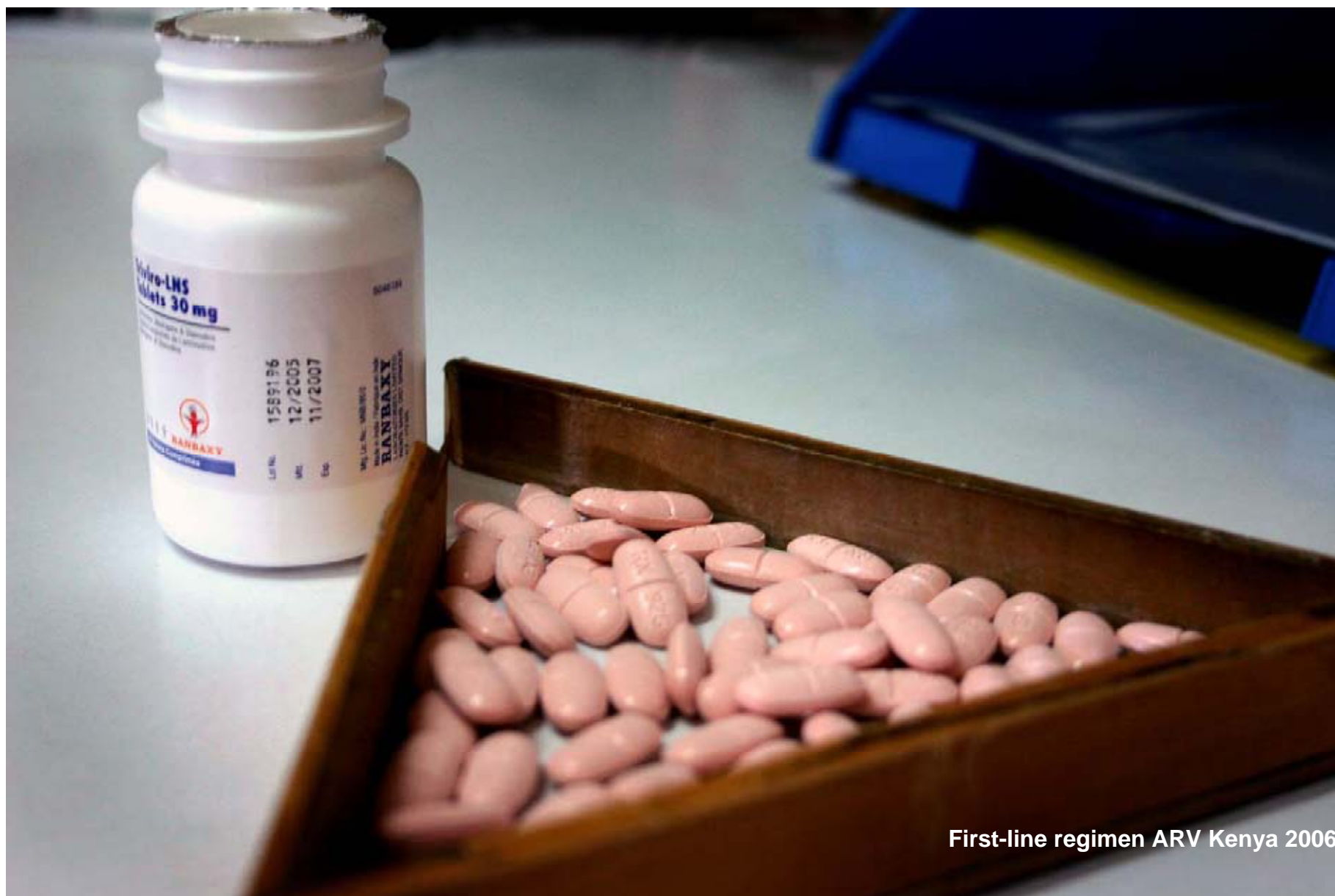
First-line regimen ARV Kenya 2006