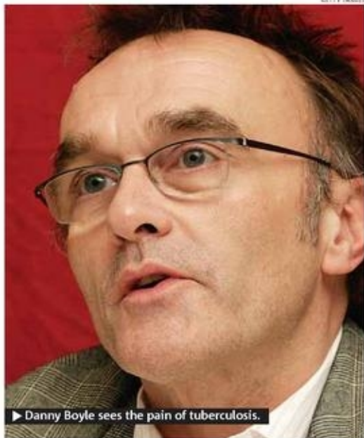
▶ Danny Boyle sees the pain of tuberculosis.