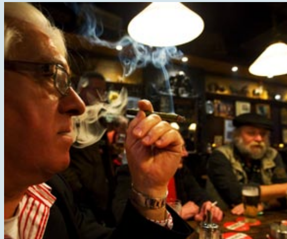
There are 8000 small businesses in the Netherlands where people can smoke because of an ambiguity in the law