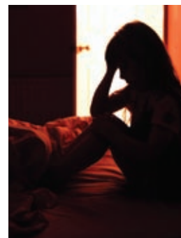
Children suffer when images are made, child charity says