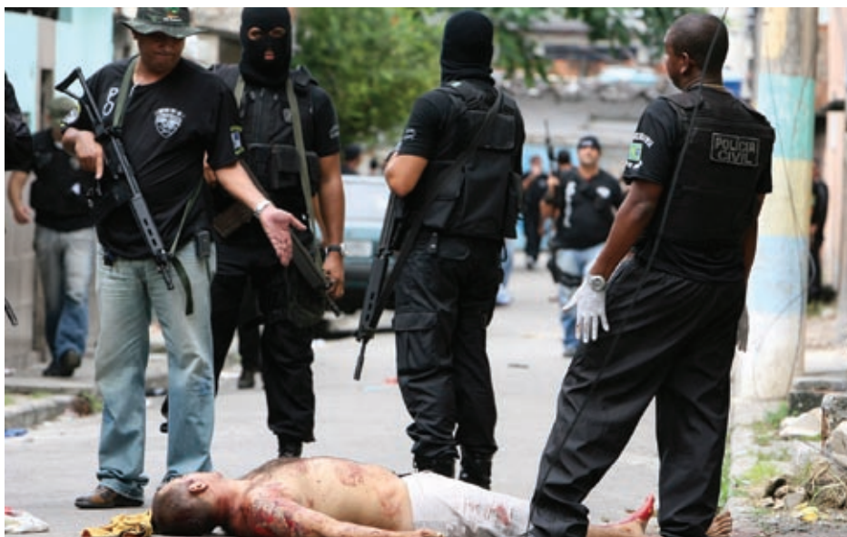
In Rio de Janeiro the murder rate fell from 46.1 to 39.5 per 100 000 in four years

Between 1998 and 2005 Brazilian authorities destroyed nearly three quarters of a million small arms, it says. Police data show that in the state of São Paulo the number of murders fell from 36 per 100 000 population in 1999 to 11.6 per 100 000 in 2007,