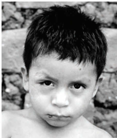
A symptom of Chagas' disease can be a swelling of the eye, as in this Panamanian child (above). The disease is spread by the vinchuca insect (right)

of the disease is with two drugs, nifurtimox and benznidazole.