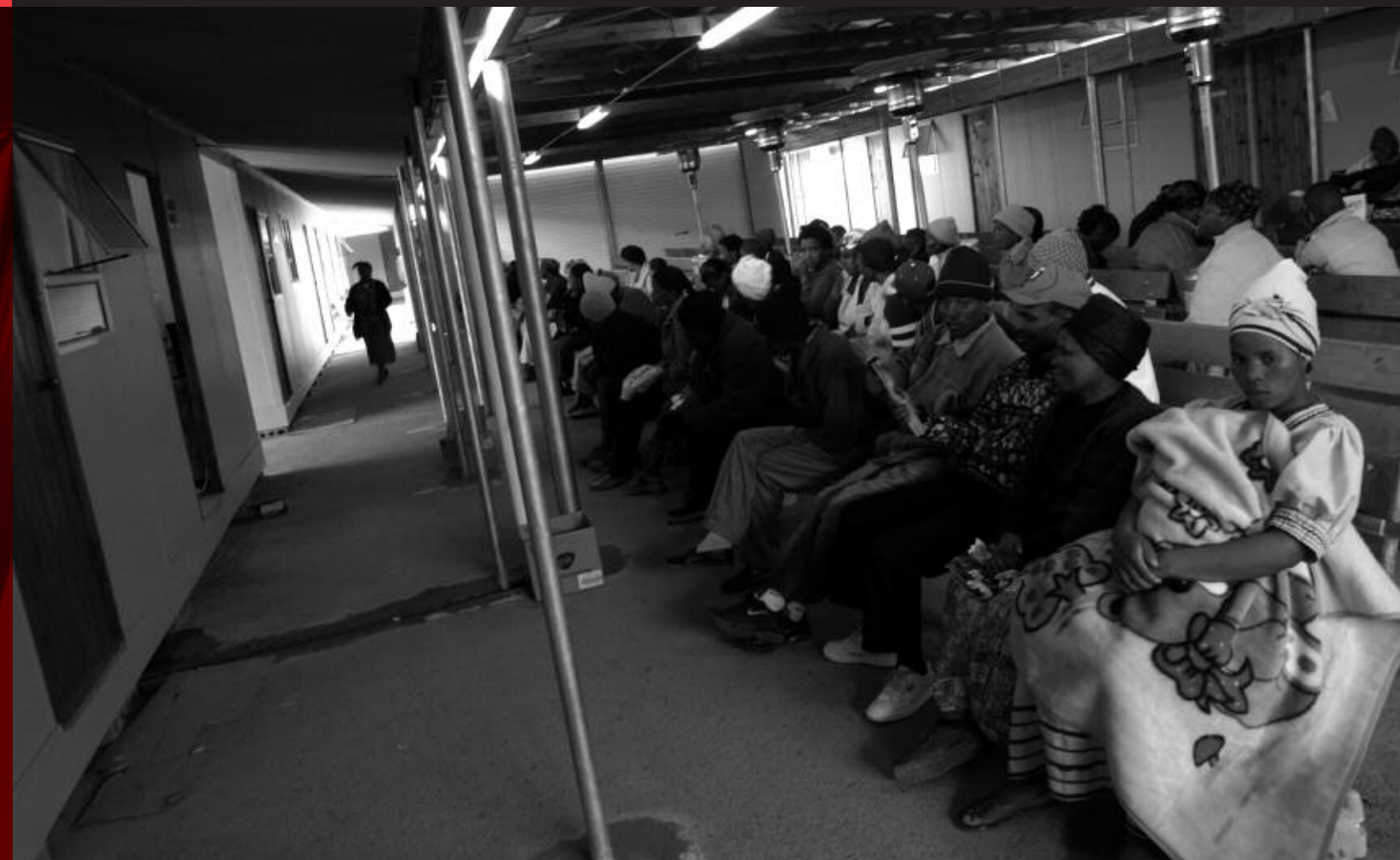
Ubuntu (means "Togetherness") Integrated HIV/TB Clinic in Khaylitsha, South Africa

Rue de Lausanne 78 Case postale 116 1211 Geneva 21 Switzerland