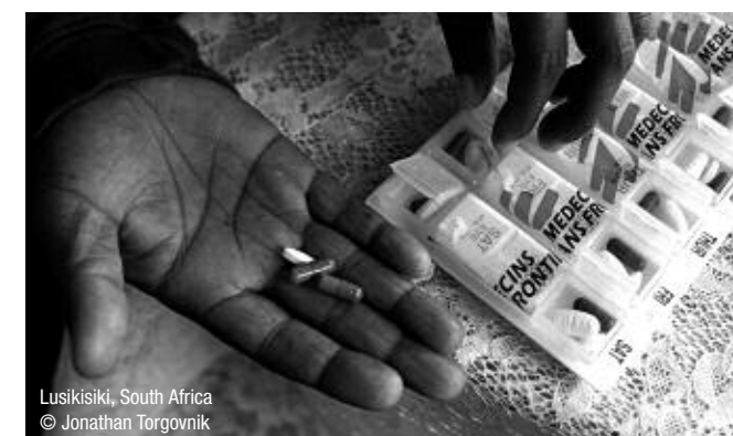
Lusikisiki, South Africa