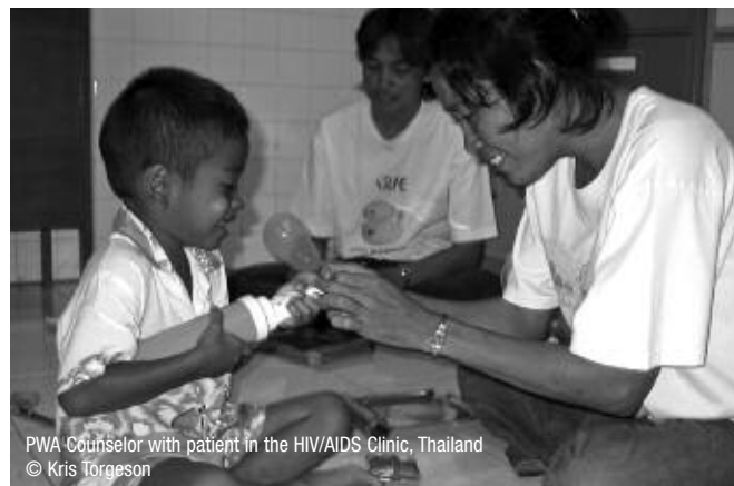
PWA Counselor with patient in the HIV/AIDS Clinic, Thailand

Nearly 90% of the estimated 2.3 million children living with HIV live in poor countries, mostly in sub-Saharan Africa. 7